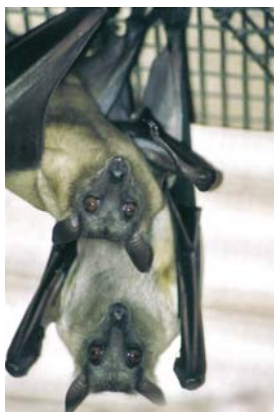
Eidolon helvum at Lubee.