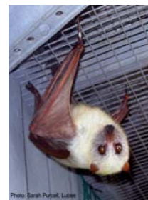
Left: Obese "Jaynee" 0.1 P.pumilus Weight= 400g